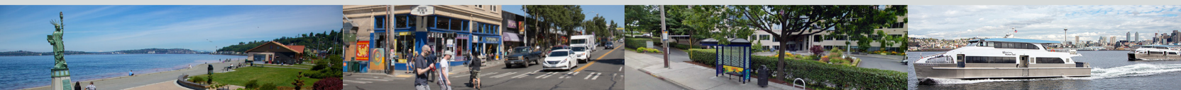
1 ALKI BEACH